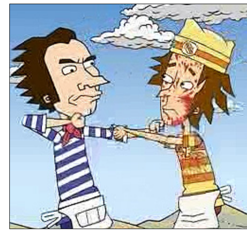
First-person audio description of Odd Job Jack

"He landed a right! Then he landed a left! Then I fell on my ass!"