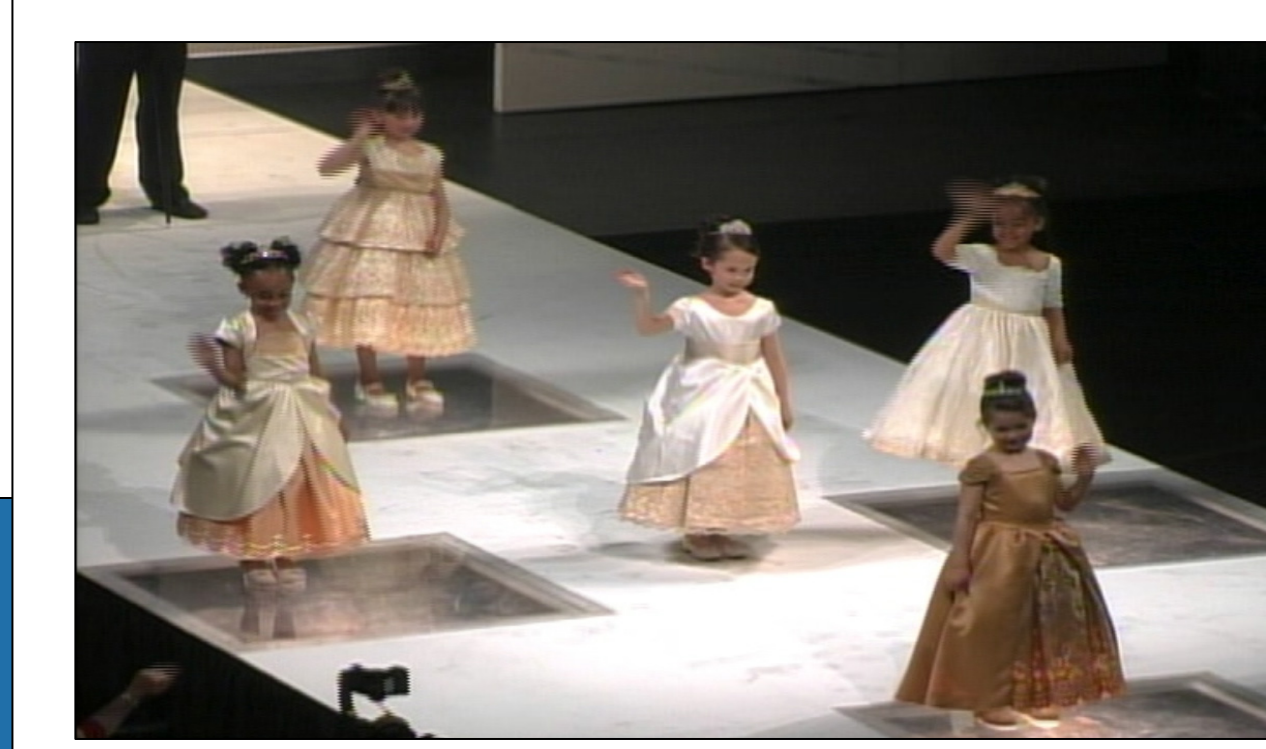
Colour commentary audio description of Mass Exodus

"He landed a right! Then he landed a left! Then I fell on my ass!"